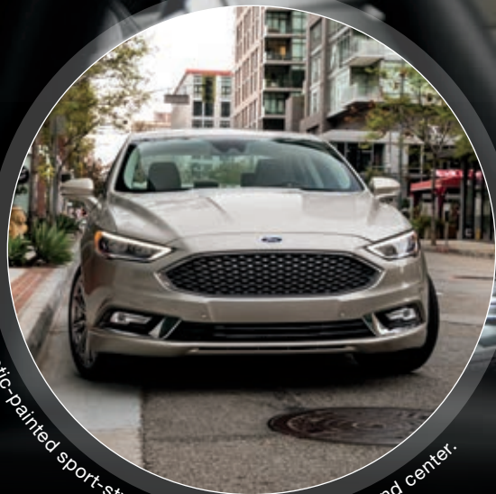
The Magnetic-painted sport-style grille puts Platinum front and center.

Every driver-assist technology Fusion offers is standard on Platinum. As is a Navigation System with SiriusXM® Traffic and Travel Link® to help guide you. Outside, Platinum distinction is marked by a Magnetic-painted sport-style grille, a power moonroof overhead, and 19" polished aluminum wheels 1 at the corners.